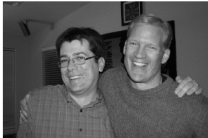
Catching up with friends in Arizona.

I am very grateful to God for the refreshing break we had over the holidays with family and friends. We also met with seven of our supporting churches, and these visits too were truly a blessing—people's interest in our work and efforts to encourage and support us in whatever way they can.