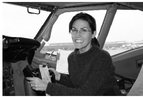
Sitting in the cockpit during a layover we had in Salt Lake City on a flight which Angie's Dad piloted.